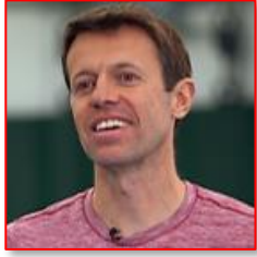
Daniel Nestor – Doubles Patterns, Sobeys Centre COE, 8:30 – 11am.

Daniel Nestor is widely considered one of the greatest to ever play doubles tennis. In his storied 28-year professional career, he earned an impressive record of 91 men's doubles titles, including eight Grand Slam victories, as well as an Olympic Gold Medal in 2000. Since retiring in 2018, Daniel has dedicated much of his time to teaching others the lessons he's learned throughout his career. By sharing his invaluable insights, he helps players like you elevate their doubles game at all levels!